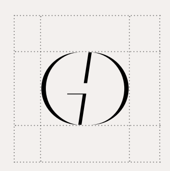
CLEARANCE ZONE 50% HEIGHT OF THE MARK